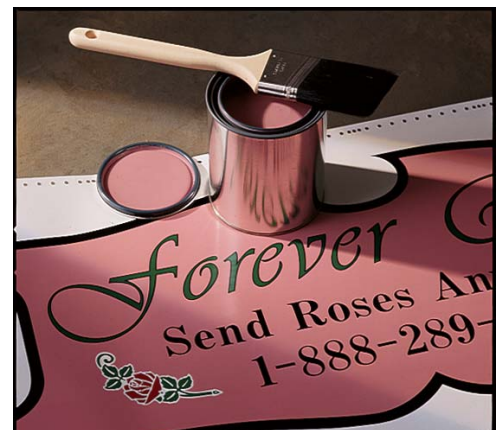
CRITICAL COLOR MATCHING

OVER 3700 COLOR COMBINATIONS AT YOUR FINGERTIPS!