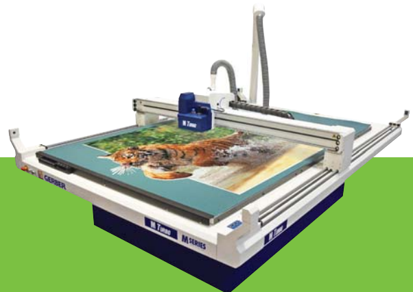
GERBER M Series flat bed cutting table