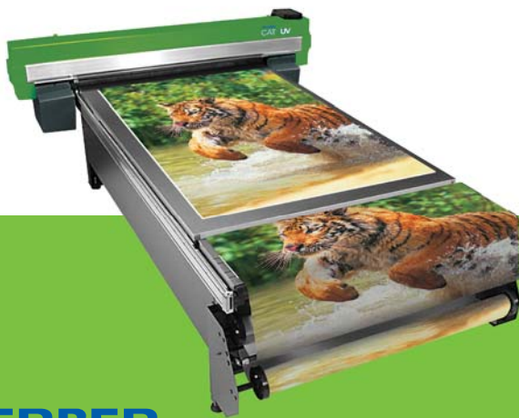
GERBER CAT | UV the next generation UV

The next generation UV flatbed and cutting table.