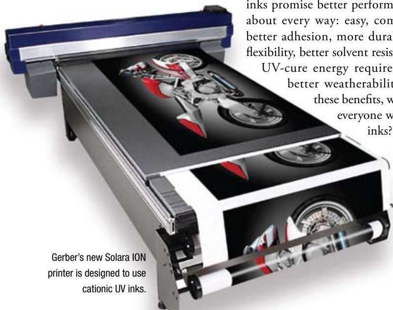
Gerber's new Solara ION printer is designed to use cationic UV inks.

Another issue that has challenged the success of cationic inkjet printing systems is the propensity of cationic inks to absorb